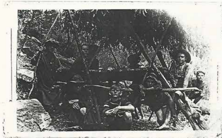
Mess table 1921 Camp.

The Fairfax Competition always maintained a high standard and the patrol leaders were usually around 18 years of age. Rover scouts had not yet started in Leichhardt.