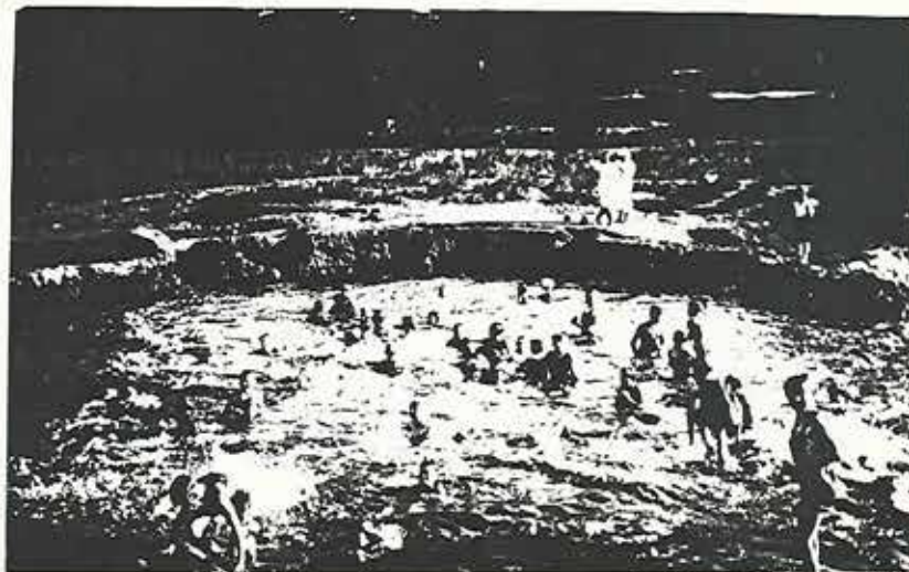
The evening out at La Perouse Bay

Special days were planned for the Stew Cooking and Billy Boiling Competitions, Blackberry Collecting and The Watermelon Day.