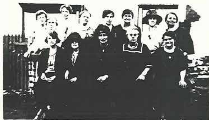
Ladies on the Group Committee 1927