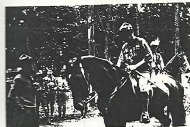
Lord Baden Powell Visits Jamboree 1933.